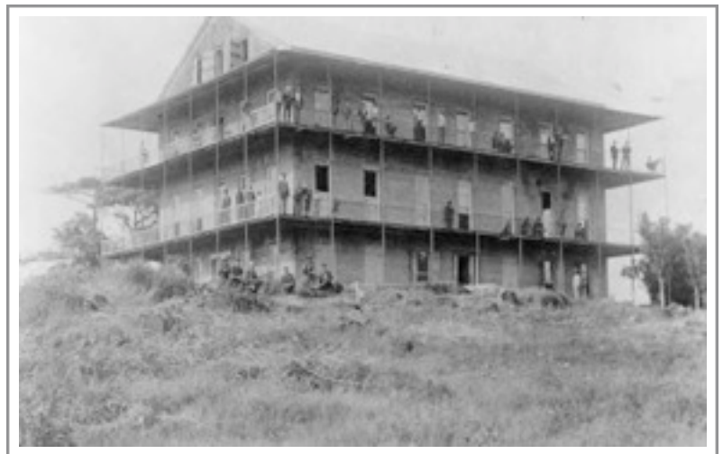
Liberia College, established in Monrovia 20 years after the American Colonization Society’s first settlement of African American emigrants in Liberia. In 1951, the college became the University of Liberia.

The American Colonization Society was only the best known of many organizations founded for the